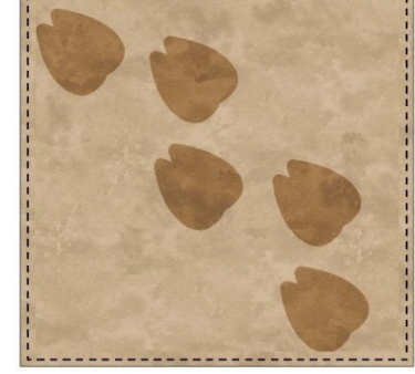
Trim to 12½" square